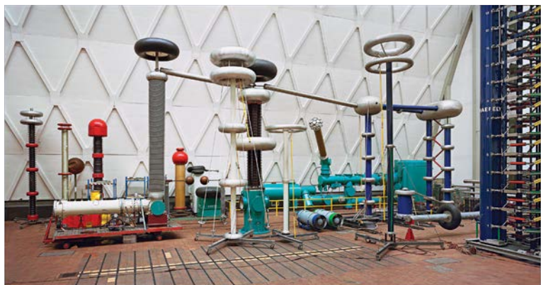
CANDID CAMERA Clockwise from top left: A work in progress from Struth's new series, which will go on view at New York's Marian Goodman Gallery in November; Schlossstrasse, Wittenberg 1991 ; Aquarium, Atlanta 2013 ; Schaltwerk 1, Berlin 2016 , also part of the Goodman show.