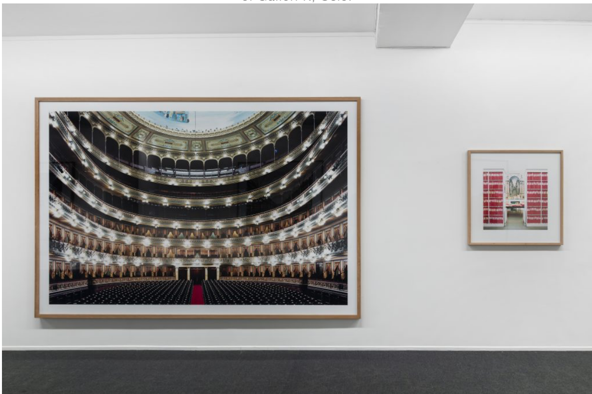
Installation view of "Candida Höfer: Libraries – Churches – Theatres" at Galleri K, Oslo. Left: Teatro Colón Buenos Aires I (2006). Right: Conway Library London II (2004).