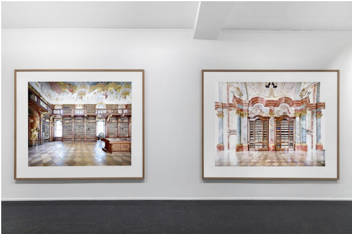
Installation view of "Candida Höfer: Libraries – Churches – Theatres" at Galleri K, Oslo. Left: Palais Garnier Paris XXXII (2005). Right: Benediktinerstift Altenburg III (2014).