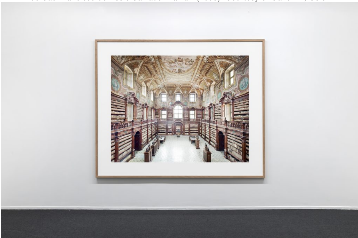
Candida Höfer, Biblioteca dei Girolamini Napoli I (2009).

"Candida Höfer: Libraries – Churches – Theatres" is on view at Galleri K, Oslo, through December 18, 2022.